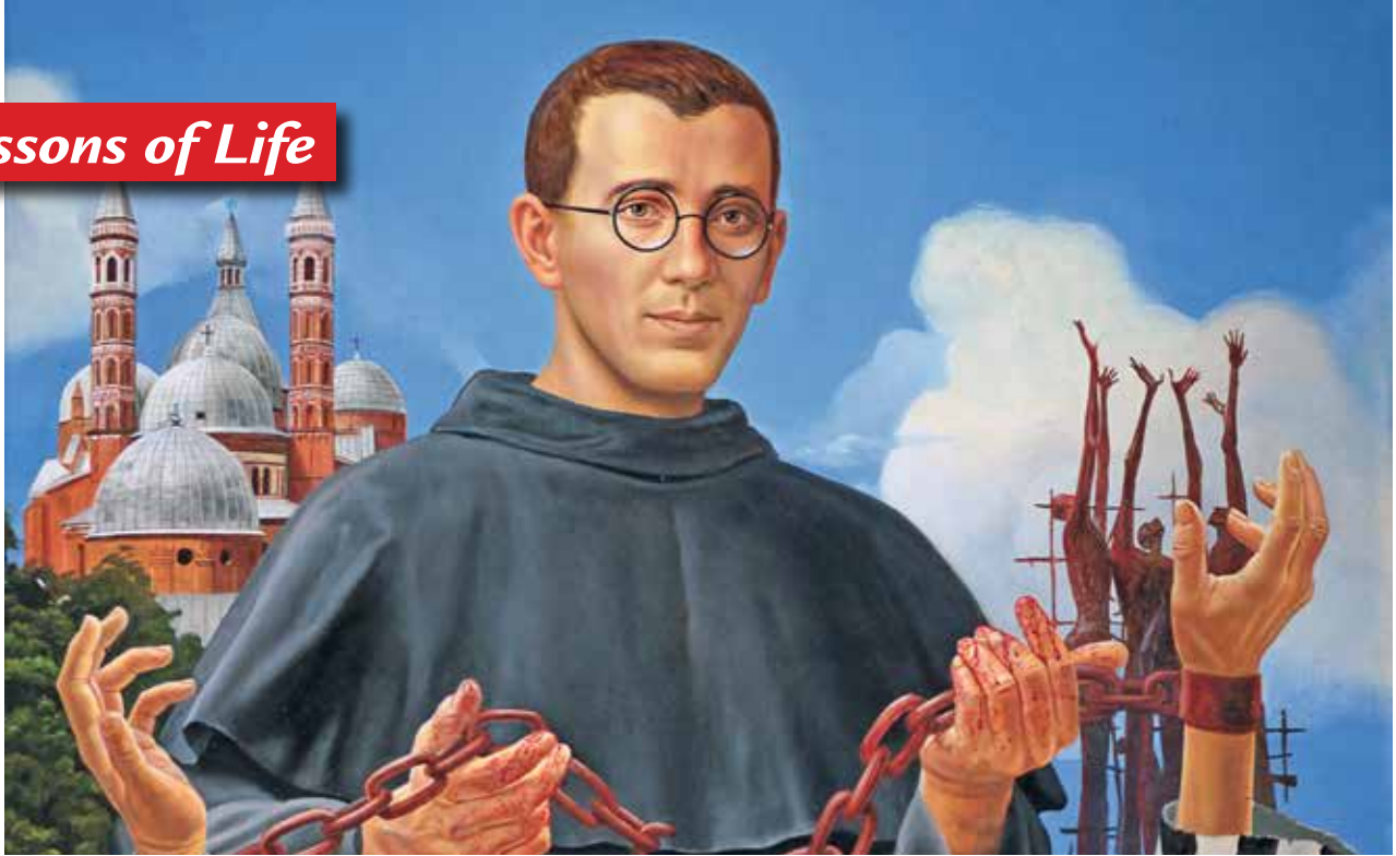
Painting by Silvano Vecchiato