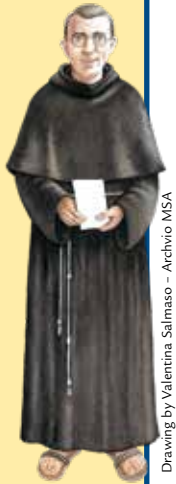
Drawing by Valentina Salmasso

formally recognize that the person has lived a heroically virtuous life. This is what has just happened with Father Placido. Pope Francis' recognition means that from now on he can be referred to as the Venerable Placido Cortese.